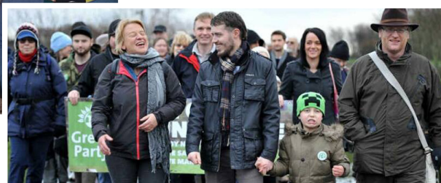
As well as campaigners to Save the Countryside she met with local residents and discussed the growth of the Green Party in Hednesford and Staffordshire.